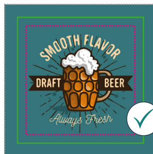
Vector (Text must be outlined)